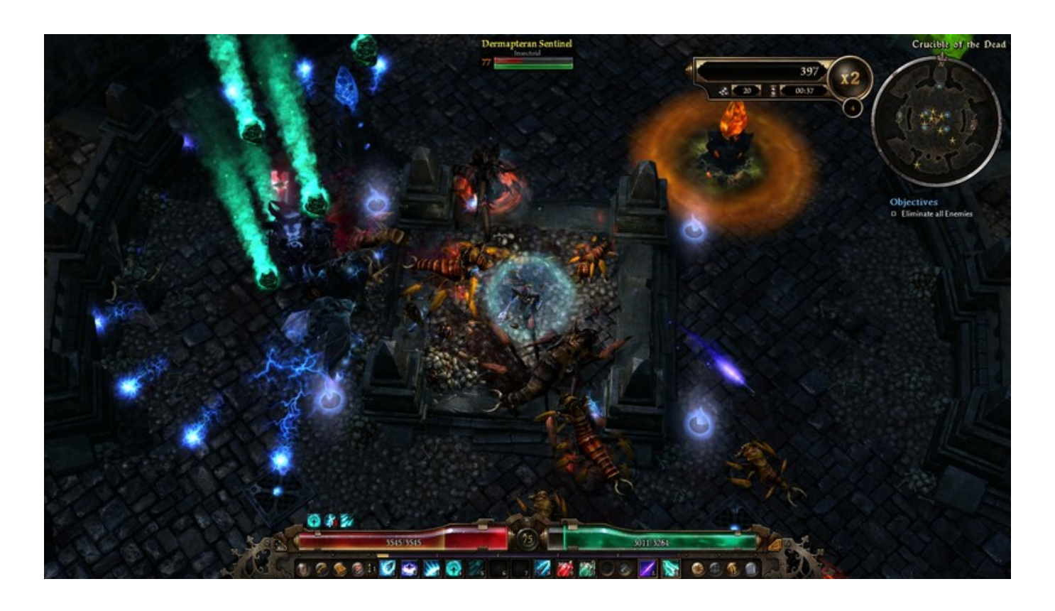
Grim Dawn - Crucible Mode DLC Download For Pc [Password]